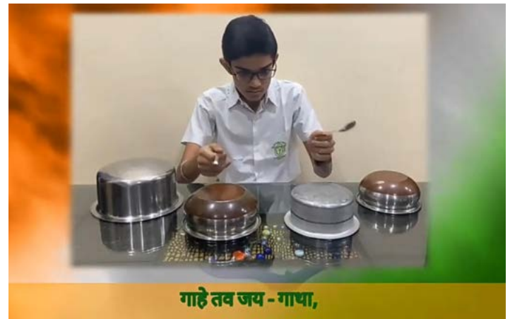
गाहे तव जय - गाथा,

The positive feedback and instant messages of parents were overflowing after the event was live and that was indeed the reward of the toil and perseverance of the DPS, GBN Team.